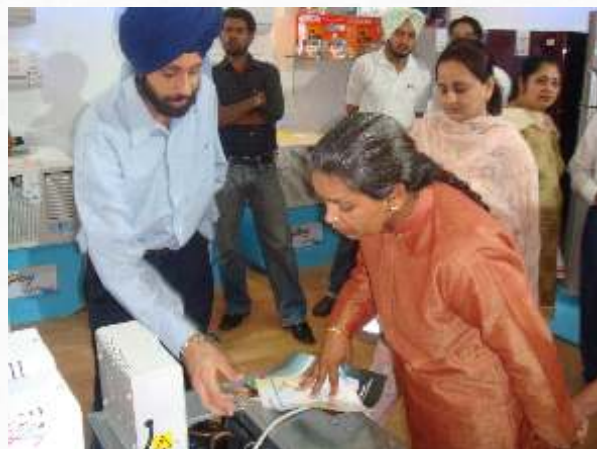
Smt Kamlesh Banarsi Das, then Mayor of Chandigarh inaugurated the fair