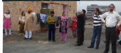
Members & staff celebrating the buoyant spirit of Independence day