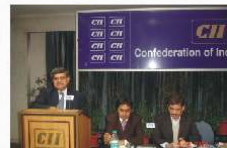
Speakers at Session on msme empowerment