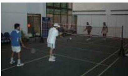
Above: View of final matches during Corporate Sports Meet