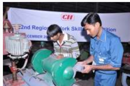
Participants at Workskills Competition