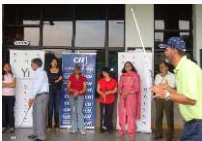
YI Members learning how to play golf