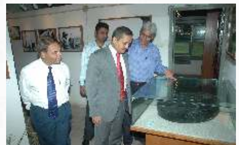
CII Regional Council Members at Le Corbusier Center