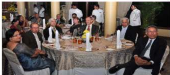
Invitees at the Dinner

We look forward to your comments and suggestions regarding the newsletter.