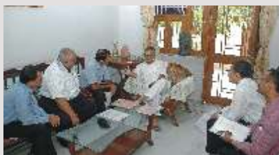
Dr C P Joshi interacting with CII delegation