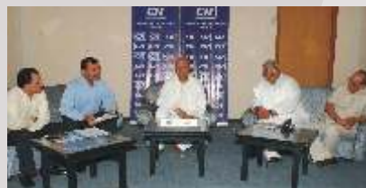
During interaction with Mr Subodh Kant Sahai, Union Minister for Food Processing Industries

Wide range of issues related to the growth and development of Rajasthan like skill development, rural development, NREGS, education, water, etc. were discussed by the panel.