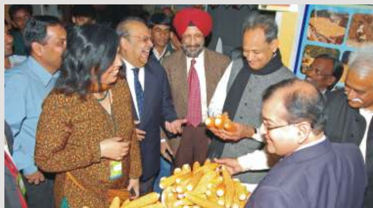
Chief Minister while visiting the Exposition

The utsav was well attended by over 7000 farmers to whom Information was disseminated through Kisan Ghosthis and Krishi Paramarsh Kendra.