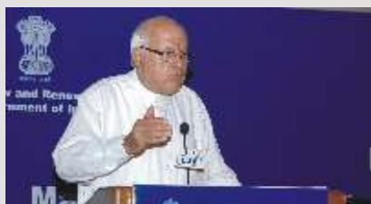
Dr Farooq Abdullah, Union Minister for New & Renewable Energy, Government of India speaking during the session

To sensitize leaders from the hospitality sector on the benefits of integrating