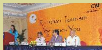
Speakers during Road Show on "Rajasthan Calling"

CII along with Department of Tourism, Government of Rajasthan organised a Road Show "Rajasthan Calling: An Experience of Indulgence & Exuberance" to promote Rajasthan Tourism in change.