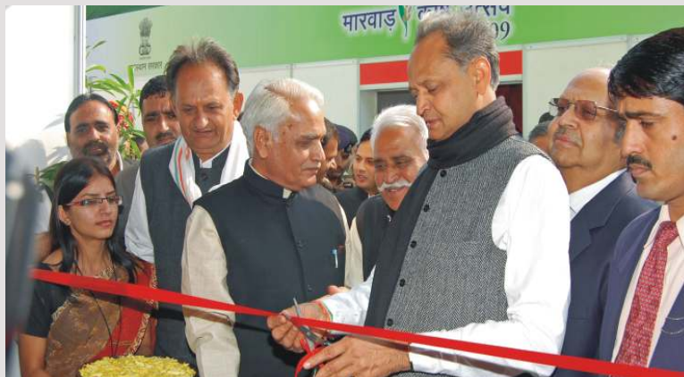
Mr Ashok Gehlot, Chief Minister, Rajasthan while inaugurating the Exhibition

Fifth in the series, Marwar Krishi Utsav aimed at bringing to the farmers the best practices and techniques in agriculture. The utsav featured an exposition with participation from 56 organizations spread over more than 1200 sq mt. The key industrial participants were Chambal Fertilizers & Chemicals Ltd; Monsanto India Ltd; Shree Shubham Logistics Ltd; DCM Shriram Consolidated Ltd; ICICI Lombard GIC Ltd; JCB India Ltd; PI Industries Ltd; National Institute of Agricultural Marketing; State Bank of Bikaner & Jaipur; Rallis India Ltd.