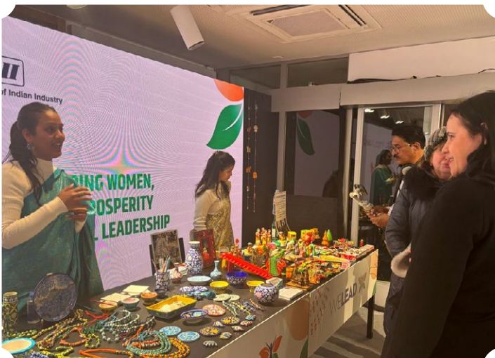
Indian crafts being showcased by women artisans at the WeLead Lounge for promoting women-led development