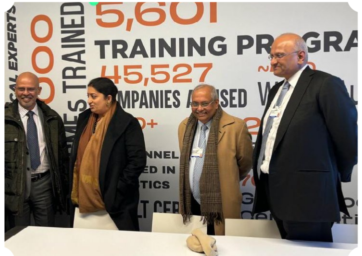
Ms Smriti Irani, Hon'ble Minister of Women and Child Development & Minority Affairs, Government of India, at the CII India Business Hub in Davos