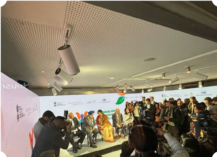
Ms Smriti Irani, Hon'ble Minister of Women and Child Development & Minority Affairs and Mr Hardeep Singh Puri, Hon'ble Minister of Petroleum and Natural Gas & Housing and Urban Affairs at the WeLead Lounge in Davos