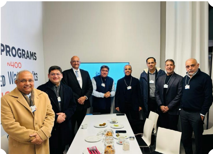
Industry leaders at the CII India Business Hub in Davos