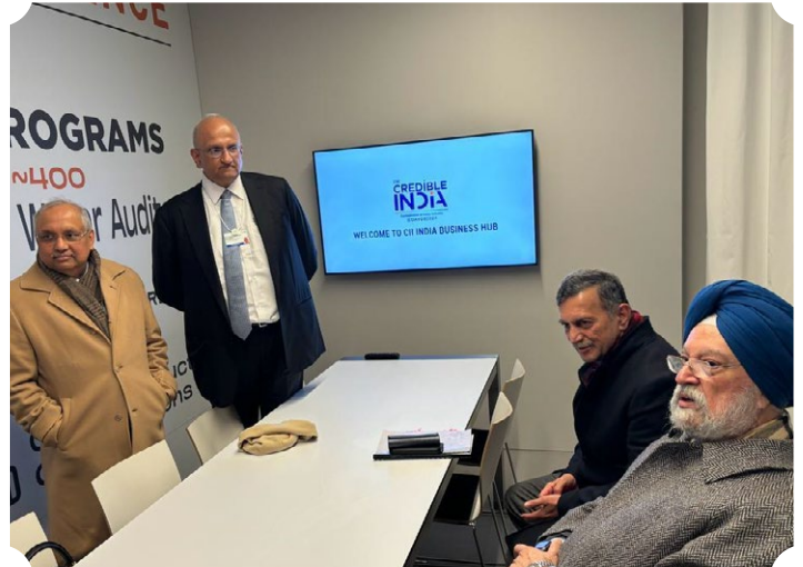
Mr. Hardeep Singh Puri, Hon'ble Minister of Petroleum and Natural Gas & Housing and Urban Affairs, Government of India, at the CII India Business Hub